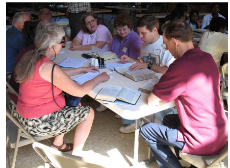
Servants Passage intensive in New York state